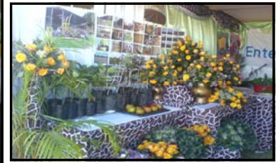
Some of the products displayed at the TAHA booth during the Labor Day exhibitions. Flowers are from Shira and Allure Flowers while the fruits and seedlings were provided by Enterprise Works

Towards the end of the stay in Iringa, the TAHA team visited the two TAHA members who are both dealing in flowers. The team started with Allure Flowers which is in Njombe. It was received by the farm man-