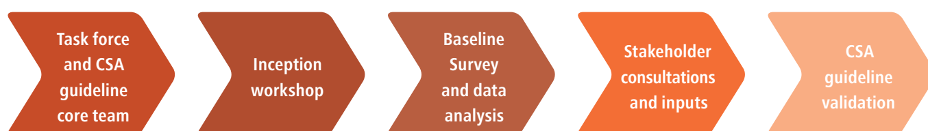
Figure 1. Process towards the elaboration of the CSA guideline

The team interviewed 600 farmers, 25 extension agents, 6 CSOs, 2 program leaders, 12 research institutions, 9 private sector representatives and 35 district officers. The type of information collected were mainly on existing livelihoods, existing technologies and practices and their climate-smart potential, climate change impacts and climate information services available, and institutional framework that govern implementation of agricultural technologies and practices. The information gathered was then analysed and the findings compiled, to be formally discussed and validated in stakeholder workshops.