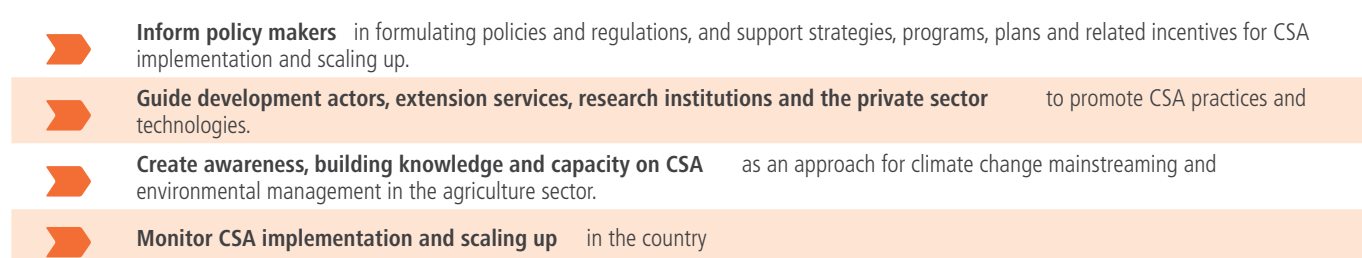
Table 1. Main uses of the CSA guideline

While it targets multiple stakeholders – including policy and decision makers; researchers from private and public sectors; farmers; civil society organizations (CSOs), including non-governmental organisations (NGOs), farmers' organisations and community-based organisations (CBOs); and the private sector engaging in issues related to agriculture sectors – the primary users of the guideline are the district development planners and extension agents. Planners can use it to plan and budget for climate-smart agricultural development, and to facilitate community level planning; and extension agents to sensitise, mobilise and train smallholder farmers to adopt agricultural practices considered climate-smart.