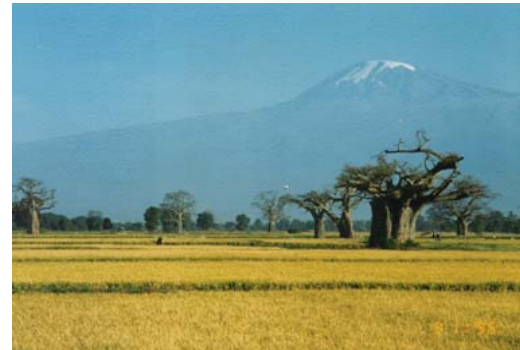
Matured Paddy fields at Lower Moshi Irrigation Scheme at the foot of Mount Kilimanjaro