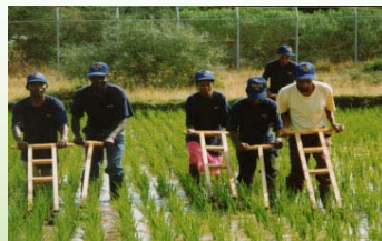
Participants (key farmers and extension officers) weeding paddy fields using rotary and push weeders.

KATC is situated in Chekereni Village, 17 km south-east of Moshi Town in Kilimanjaro Region. It also maintains an office in the Kilimanjaro Industrial and Agricultural Development Building, adjacent to the Regional Administration Building. KATC Chekereni compound is located in the heart of Lower Moshi Irrigation Scheme which provide the most suitable training ground for its courses.